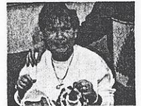
Making Mercy Merry see page 8