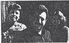
Unite for Health Care see page 2