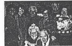
Mercy Pix Volunteer Party see page 7