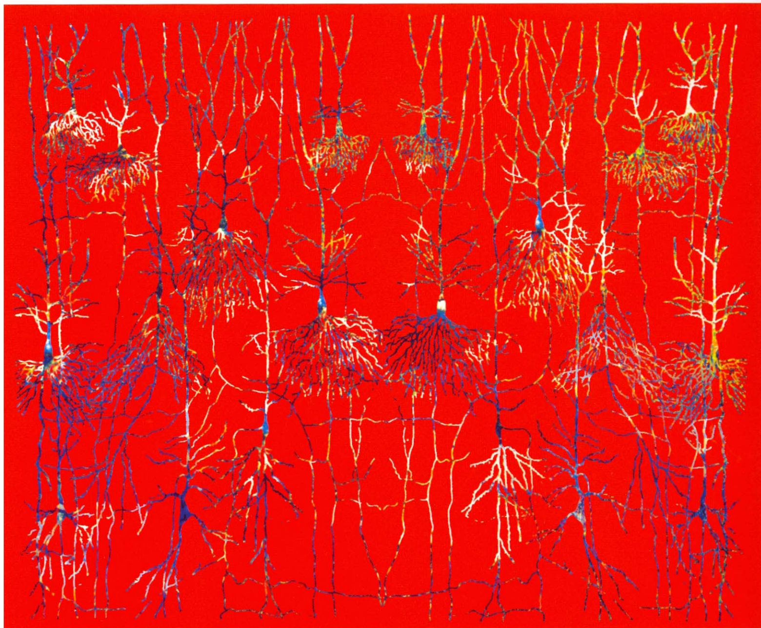
Audrius V. Plioplys. Dreams / Explorations (from the series "Emergence"). 2008. Archival quality Giclée print on paper. 18 x 22 inch